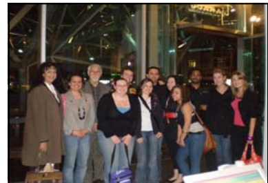
Some members of the Social Committee who attended the dinner at Tjanabi.

The Social Committee wants to say a HUGE thank you to everyone who attended events this year and we are looking forward to seeing more people at the events planned for the 2009 social calendar!