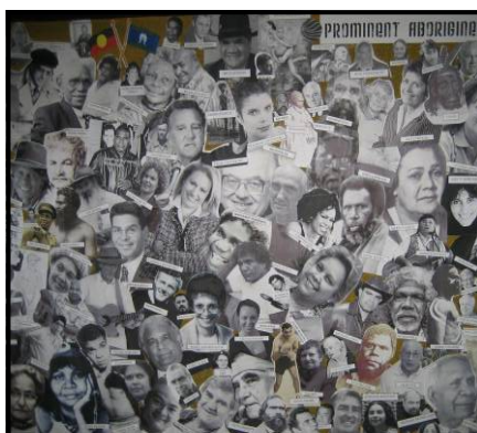
The CAIS Collage of Indigenous Heroes and Supporters

Who were the candidates for the collection of images representing prominent Indigenous Australians and their supporters? Administration staff worked together and drew up a