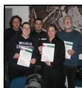
Graduates of the Indigenous Mental Health course.