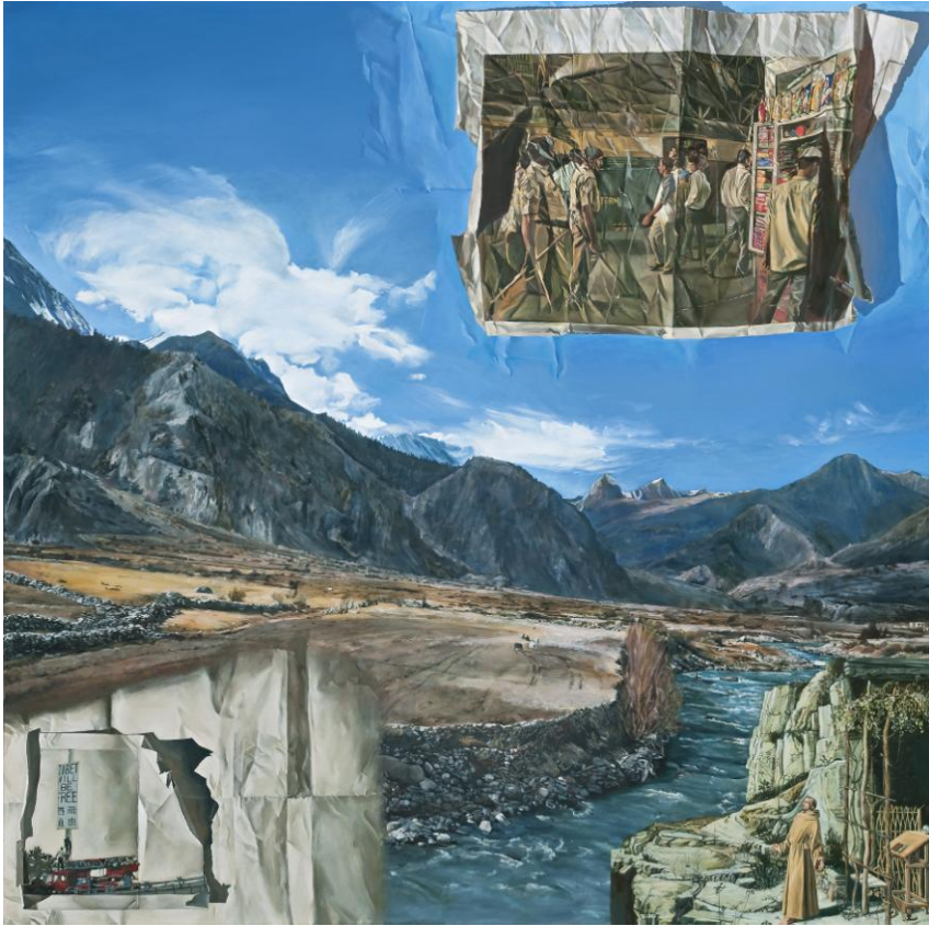
Figure 4. Lyndell Brown and Charles Green, Manang (Tibet will be free) , 2010, oil on linen, 121 x 121 cm.

In 1984, Green was walking on the very spine of the Himalayas, crossing to the Tibetan side of the Annapurna massif. A few months later he was to meet Brown, and she was to feel the same powerful connection with Asia and India, and Central Asia in particular. The main image of Manang (Tibet will be free) is of the valley floor just below that crossing. At the lower left corner, a crumpled clipping displays a slogan that protestors attached to buildings in Beijing during the Olympics; the image of the protestors atop this communications tower in Beijing adds poignancy in the light of the terrible horrors the Chinese Government has inflicted upon Tibet. At the lower right, we placed a detail of Bellini's St Francis , from the Frick Museum in New York, and at the top right, we painted a larger image of Indian police patrolling for terrorists in Mumbai railway station.