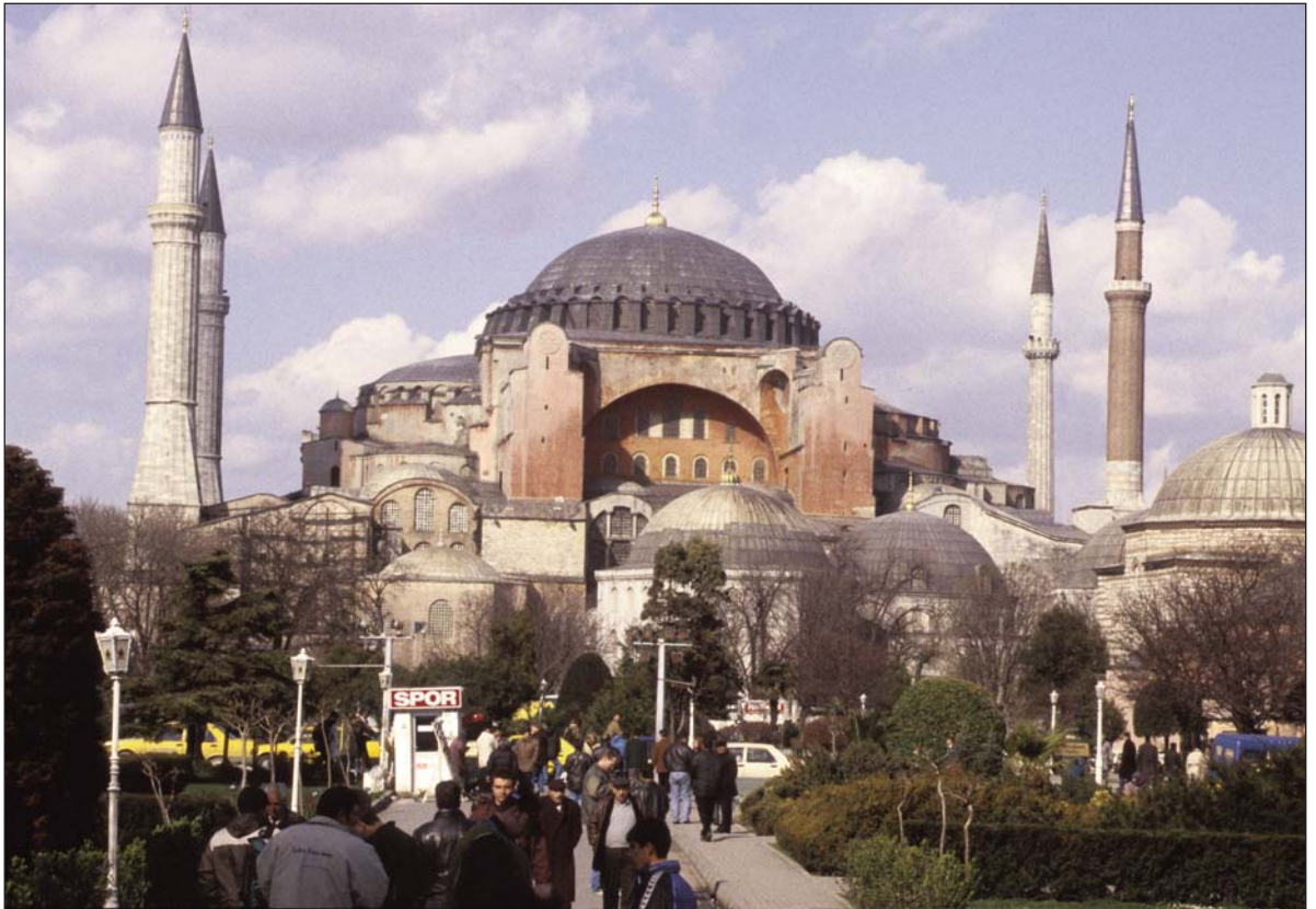
Hagia Sofia; Istanbul